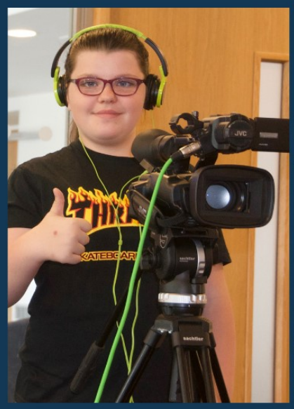
Get trained in video journalism, presenting and film production.

Application Deadline: 12pm on 22nd March 2024