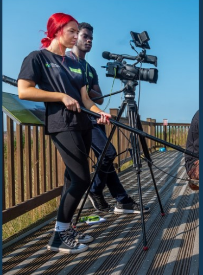
You'll learn about camera, sound, presenting, scheduling and broadcasting!