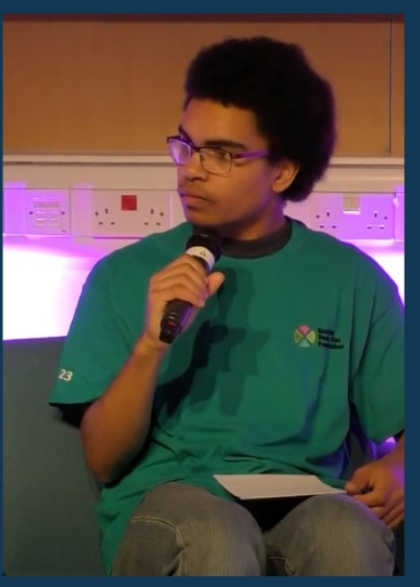
Live stream a halfhour show from the Scottish Youth Film Festival